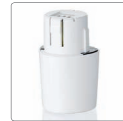
Extra rechargeable battery ensures a charged battery is always available