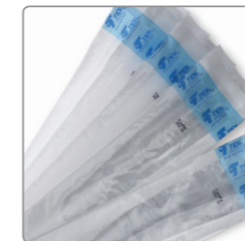
Disposable hygienic sheaths