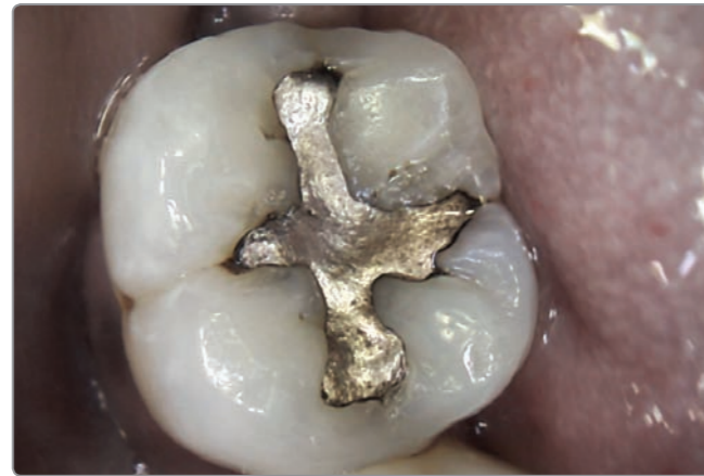
Visualize the smallest details with crystal-clear views and true-to-life colors.

From full arch to macro views, the Kodak 1500 camera delivers the industry's highest resolution for still images (1024 x 768). Boasting the widest focus range on the market (1mm to infinity), the camera offers the large depth-of-view required to capture both intra- and extraoral images. And thanks to the camera's advanced sensor and lens, practitioners can easily view minute details such as cracks, caries, lesions and tooth surfaces.