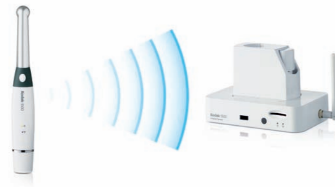
Built-in digital Wi-Fi for reliable and fast image acquisition—no wire required.

Available in both wireless and wired versions, the Kodak 1500 camera's wireless configuration features state-of-the-art Wi-Fi technology to ensure the most flexible and mobile solutions for your imaging needs. Offering faster transmission times, more stability, and less noise than analog wireless devices, the Kodak 1500 camera provides maximum reliability, while delivering the same image quality as the traditional wired version.