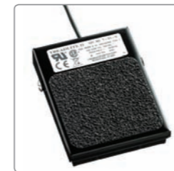
Optional foot pedal