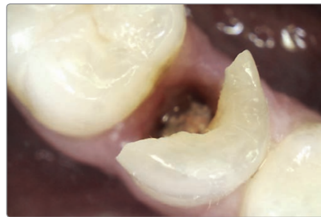
Receive crystal-clear views and true-to-life colors.