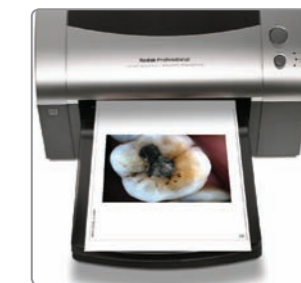
3 Print the image on any kind of printer.