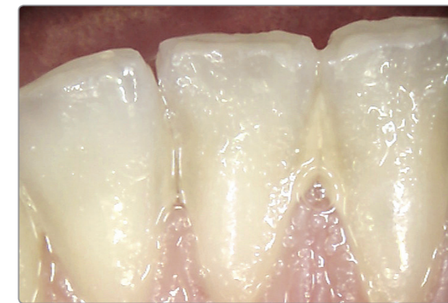
High-resolution images reveal even the tiniest details.

Weighing as much as 50% less than other wireless cameras, the Kodak 1500 camera ensures maximum comfort for its users. Easily maneuverable, the camera's lightweight handpiece makes exploring even the most hard-to-reach areas simple. Don't let its size fool you, however...the Kodak 1500 camera has been designed for superior reliability. And the neutral, stylish design ensures that the camera fits into any practice décor.