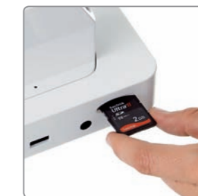
2 Save the image to your computer or SD card.