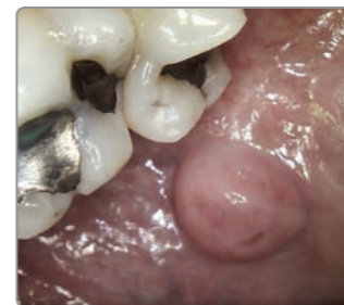
Distended saliva duct.