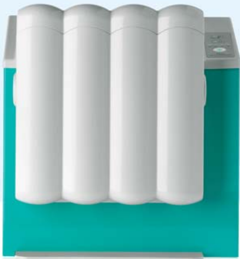
KaVo QUATROcare® 2104. Device in the standard design without compressed air connection KaVo QUATROcare® 2104 A. Device with compressed air connection to blow clean the smallest spray channel

Material-Nr.: 1.004.1434.08/06 en We reserve the right to make technical modifications. Slight colour differences are due to the printing process. © Copyright KaVo Dental GmbH.